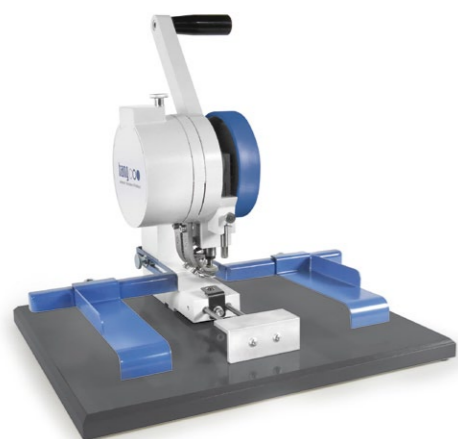
Model 102-00 / 102-04