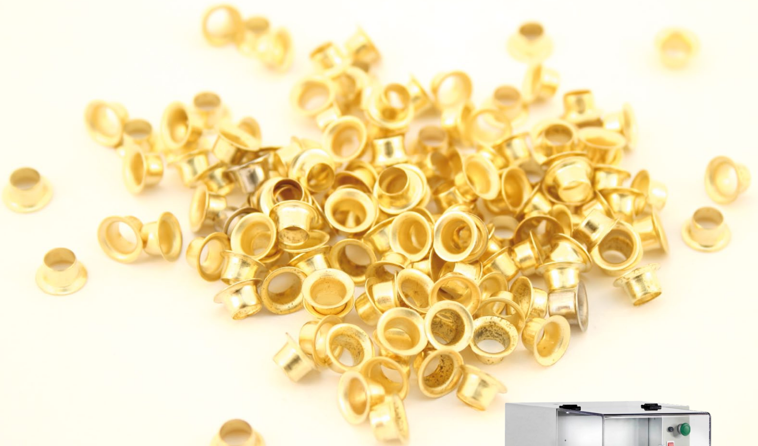
Twin head eyeletting machine PiccoStar 102-60