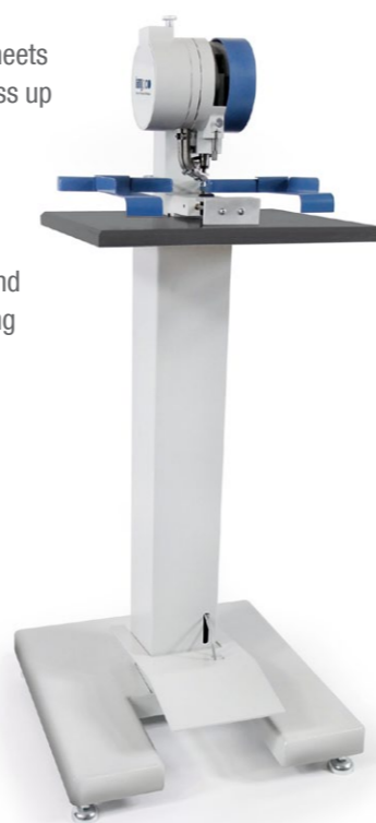
Model 102-20 / 102-28